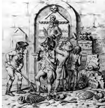
12 - Italian satire on requisitions by the revolutionary French people of valuables, foodstuff, livestock, clothes, historical finds, works of art and the fat of the land. February 1797. Paris.