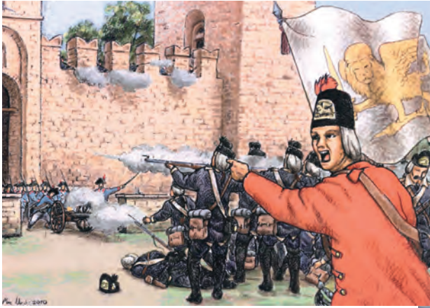
< 23 - Besieged by the Veronese people, Castelvécchio is surrendering and hoisting the white flag. To negotiate with the enemy, the insurgents made a tactical mistake and got too close to the enemy. After loading their canons, the French revolutionaries hurled fire and death upon the Veronese people. The most powerful army of the world resorted to these abject manoeuvres to quell the rebellion. Painting by Michele Nardo.