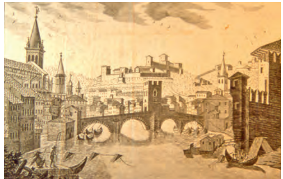
6 - The splendour of Verona before the revolution: View from the East with Ponte delle Navi, 1750 ca. Drawing by Gian Francesco Avesani, engineer. Engraving by Valesi. Verona. Public library. Printings and drawings cabinet.