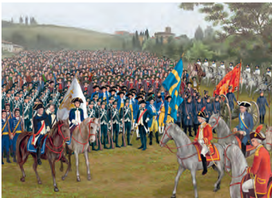
16 - Review of the Venetian troops and rebels by the Venetian and Veronese authorities in San Pietro in Cariano, before the insurrection of the Veronese Eaters . The Valpolicella was to give all its men for the defence of the Country. Painting by Giorgio Sartor. Detail.

The people advanced inch by inch towards the fortresses, rejected every attempt at sortie by the enemy and considered as traitor anyone who wanted to negotiate with him.