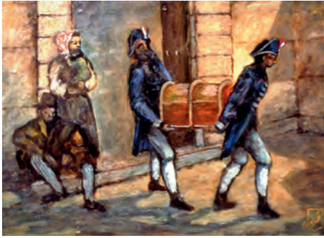
29 - On the very first day of their return to Verona, the very thing they do, the Napoleonic soldiers plundered the pawnshop where the gold of the poor was kept. Tempera on wood by Quirino Maestrello.