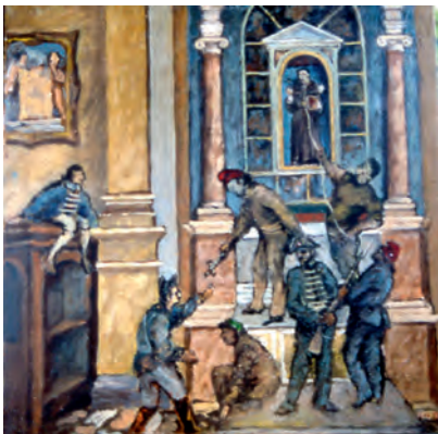
14 - Verona. The revolutionary iconoclasm during the French occupation. The statue of Saint Nicholas from Tolentino in Sant'Eufemia is being pulled down using ropes by the insubordinate troops, but surprisingly stands. Their efforts are vain, so at the height of their rage, the sanculottes bludgeon it. Despite their savagery, the statue remains intact. Tempera on wood by Quirino Maestrello.

Not to be overthrown in turn by violence or by betrayal, Verona Fidelis (Faithful Verona) immediately gave proof of its loyalty to the legitimate Government, asking the Venetian Senate permission to arm and defend itself against Bergamo's and Brescia's Jacobins. Forty thousand Veronese people were in arms, among whom very many farmers of the cernide led by the young General Antonio Maffei, mustered to garrison the border with Brescia, liberate various villages and even go as far as to besiege Brescia. The yellow-blue cockade - the town colours - was their emblem. Verona's Bishop, Mons. Gianandrea Avogadro, the model of charity for all the counter-revolutionary fighters, gave the order to melt the silverwares of the churches for the salvation of the Country.