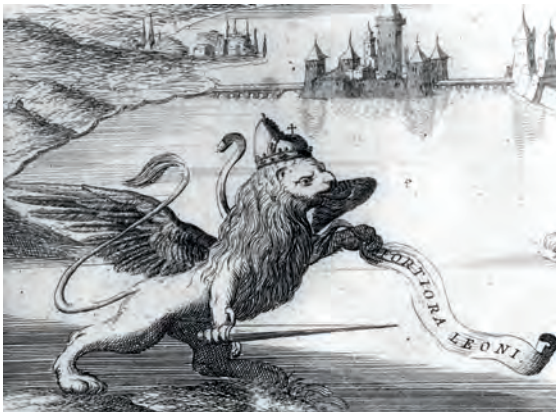
3 - The Lion of St. Mark with ducal horn and clenched sword in the fist. Fortiora Leoni on the scroll means that the greatest deeds pertain to the lion. Venice. Correr Civic Museum Library. Gherro Collection.

Only the people and a good part of the clergy (specially the lower one) had remained impervi-