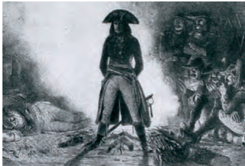
11 - March 1796. A menacing Bonaparte ready to fall upon Italy. The troops from a blood-surfaced France on the brink of economic collapse are crossing the Alps to plunder the most prosperous nations in Europe and spread the principles of the anti-Christian Revolution. Paris.

In March 1796, Napoleon Bonaparte, an unknown Corsican official (favourite of the mistress of Barras, at that time the head of the French Directory) already distinguishing himself a few months before, during the cannonade against the Parisian crowd, received the command of the Army of Italy. He was entrusted with the order to open a secondary front, to the one on the Rhine, against Imperial Austria.